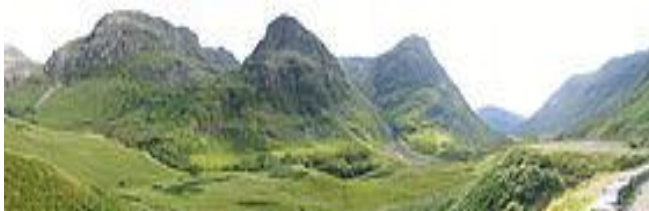
Glencoe in the Highlands of Scotland